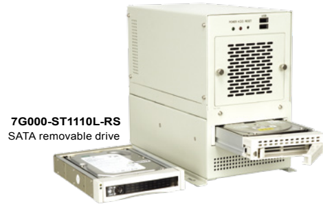
3.5" SATA removable drive bay compatible